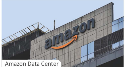
Amazon Data Center