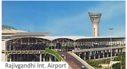
Rajiv Gandhi Int. Airport