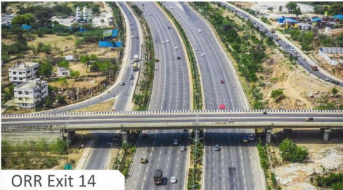
ORR Exit 14